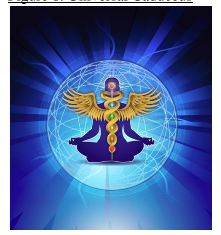
Figure 8. Universal Caduceus

In this state there are no more limitations (curse), but all are in the oneness of God. The manner of human evolution continues for those not yet enlightened, but all receive their reward according to their works. By following divine guidance all can become enlightened, and live the divine Life beyond the human realm.