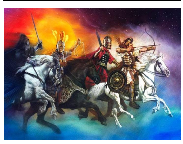
Figure 2. The Four Horsemen of the Apocalypse

Chapter 6 describes the evolutionary unfoldment of the chakras at the personality level, using astrological symbolism for the first four chakras (seals). These are the legendary four horsemen of the apocalypse, being Sagittarius the white horse, Scorpio the red horse, Libra the black horse, and Virgo the pale horse. They represent the descent into black materiality (death and hell) and the dawning (pale) of higher values. Horses represent the lower quaternary (4 legs) so the next two chakras use instead the imagery of souls and radical