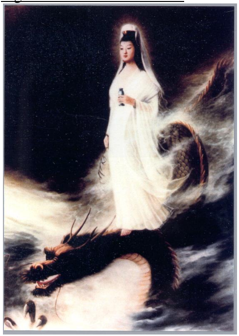
Figure 6. The Bride of Christ

Chapter 20 is about the readjustment of the relation between Crown chakra (its symbol is 1000 years, the 1000 petalled lotus) and base chakra (the bottomless pit). The kundalini dragon is chained to the crown via the other chakras till the crown is aligned with both the whole of human nature and with higher spirit. During this adjustment period the human souls are assessed for their light and purity, and those surpassing the lower mind (beheaded) live in the Christ consciousness through the crown. This is the first resurrection of souls. The second resurrection (death to the old) occurs when the souls that did not make it the first time are scorched with spirit and transformed, and then judged. Those still not up to scratch are sent for further transmutation (cast into lake of fire). The dragon is also transmuted to a higher frequency this way, as are the lower planes of death and hell. This is needed to prepare the subtle bodies for ascension into the next kingdom of the masters.