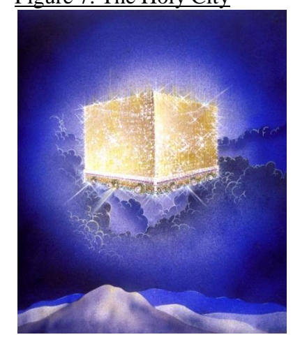
Figure 7. The Holy City

The awareness is now the oneness with all that is divine (the tabernacle of God with men) and there is no more need for incarnation (death) and the tribulations of the incarnate world. In this state spirit unites with the purified soulpersonality (New Jerusalem) to create the unified Holy Jerusalem. Its description that follows is based on the archetypal 12 of love-wisdom of the heart, of the 12 superior petals of the Crown chakra, of the zodiac and the cosmic Christ. This is so because the soul has attained the initiation of Renunciation (or Crucifixion) that is directed by the 4<sup>th</sup> ray of the heart and Buddhic plane. This initiation represents completion of the human journey.